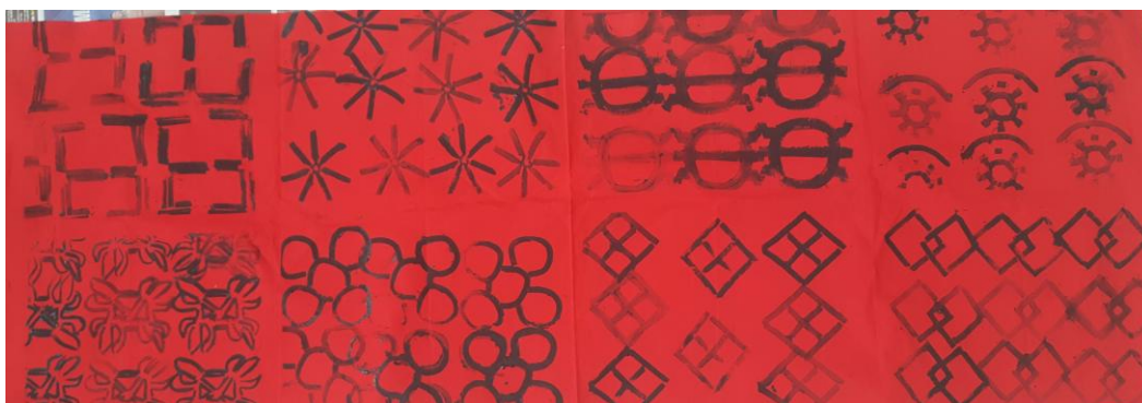
Unity in diversity