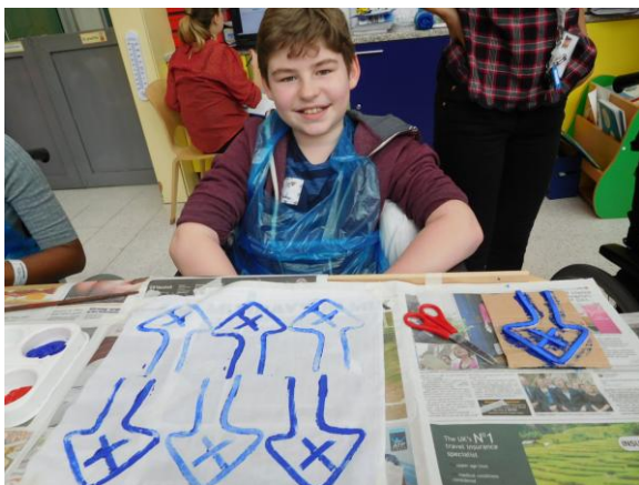
“The end of War”

For some children it was a joy to recognise elements of their culture, and they were able to participate and enlighten the rest of us.